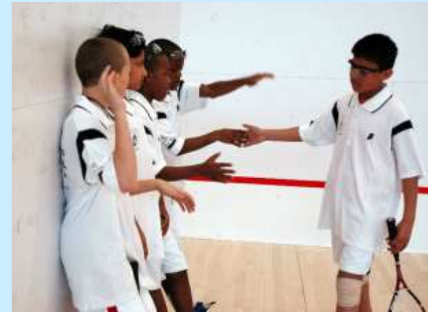
...Giving Kids Their Best Shot