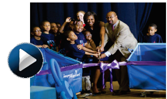
Watch: The SquashSmarts Program

SquashSmarts year-round programs work with students and their families at two state-of-the-art facilities located in high-need communities: West Philly's Arlen Specter US Squash Center and North Philly's Lenfest Center. Our Core Program serves 160 students and 180 alumni from five K-12 partner schools while our Community Program serves an additional 750 students and family members.