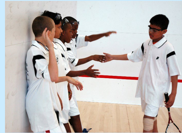
...Giving Kids Their Best Shot